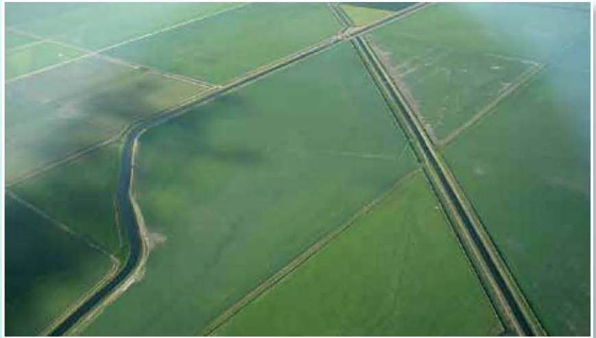
An aerial view of irrigated fields in the upper Klamath River Basin, Oregon.

In 2012, the U.S. Geological Survey (USGS) and the Bureau of Reclamation (Reclamation) began a multi-year partnership to evaluate more than 20 years of Klamath River Basin water-quality data collected by Reclamation. The datasets consisted of time-series data and laboratory results from discrete water-quality samples. The goal was to assess the quality of the data, make appropriate corrections, and archive the results in the USGS National Water Information System (NWIS), where the data will be available to the public for exploration and analysis.