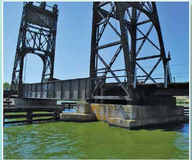
Water appears green near this railroad trestle in Lake Ewauna, Oregon, because of an algal bloom.

Hourly water-temperature and dissolved-oxygen data collected by the Bureau of Reclamation at Klamath Straits Drain near Hwy 97 (420451121510000) from May 1 to November 1, 2004, reveal an inverse relation. The USGS Data Grapher allows users to explore time-series data and create customized graphs and tables of the data.